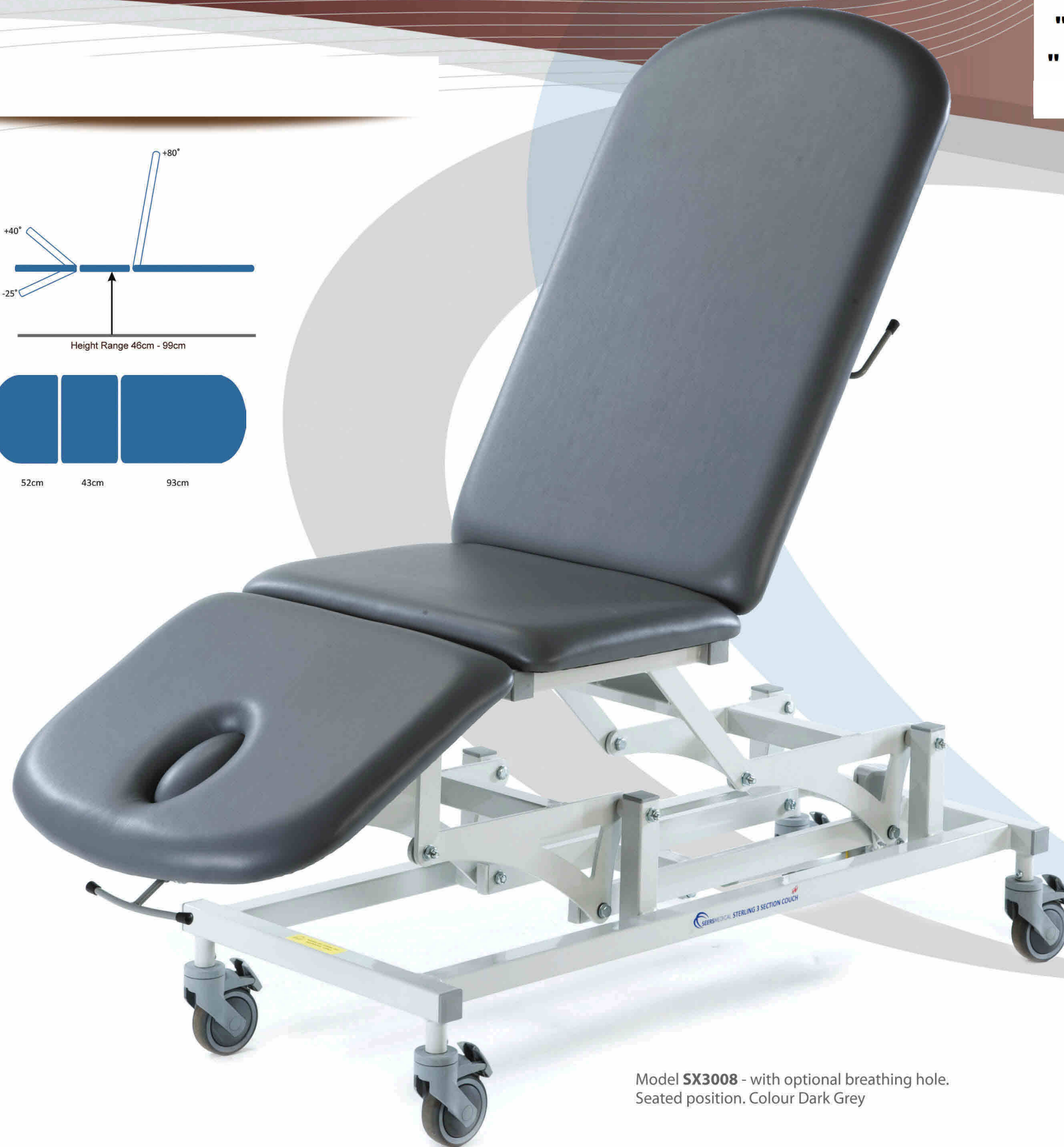
Model SX3008 - with optional breathing hole. Seated position. Colour Dark Grey