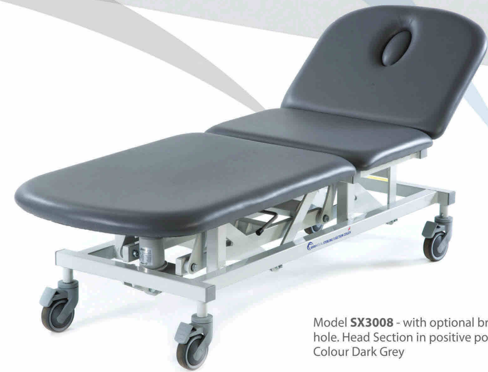
Model SX3008 - with optional breathing hole. Head Section in positive position. Colour Dark Grey