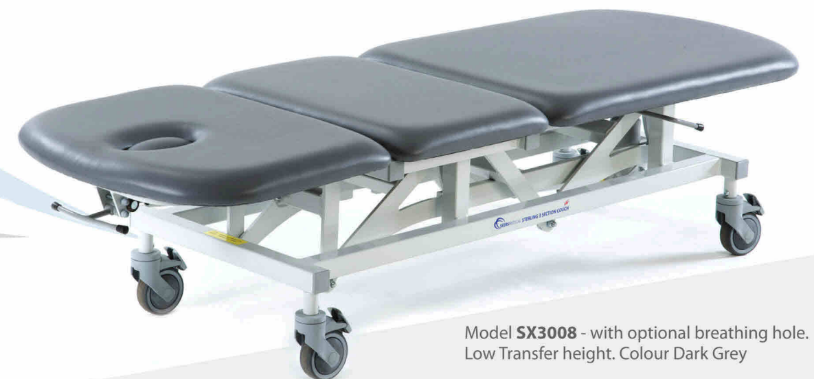
Model SX3008 - with optional breathing hole. Low Transfer height. Colour Dark Grey