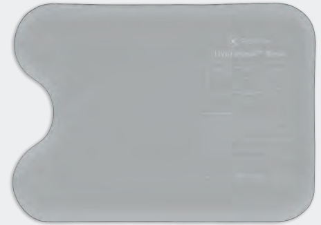
HP-1713-OS Oversize 17" x 13" (43 x 33cm)