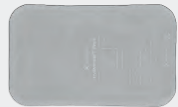
HP-1210-ST Standard 12" x 10" (30 x 25cm)