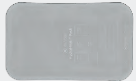
HP-1711-LG Large 17" x 11" (43 x 28cm)